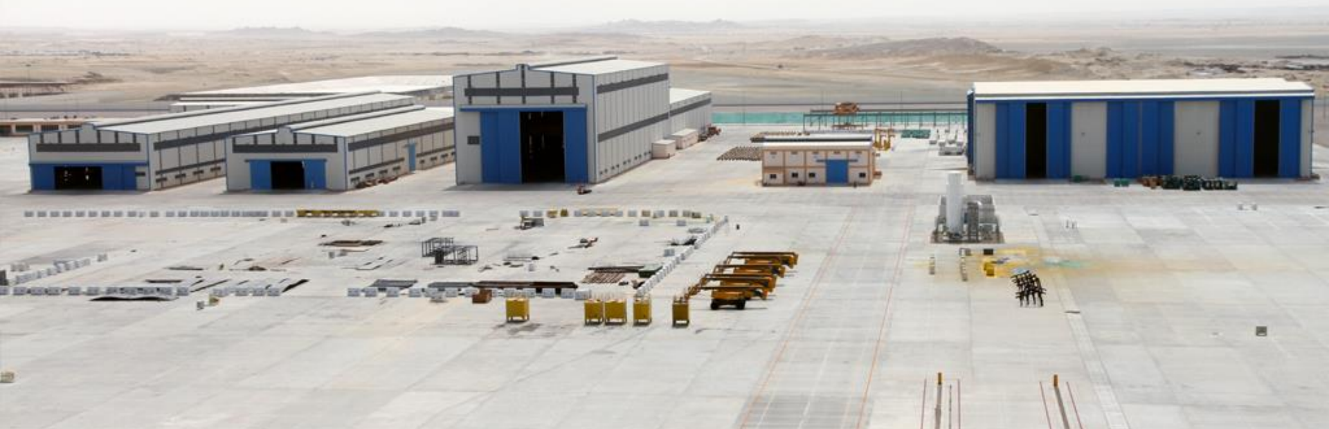
Shop Area – Front View

شركة عُمان للجَوْف الجاف OMAN DRYDOCK COMPANY