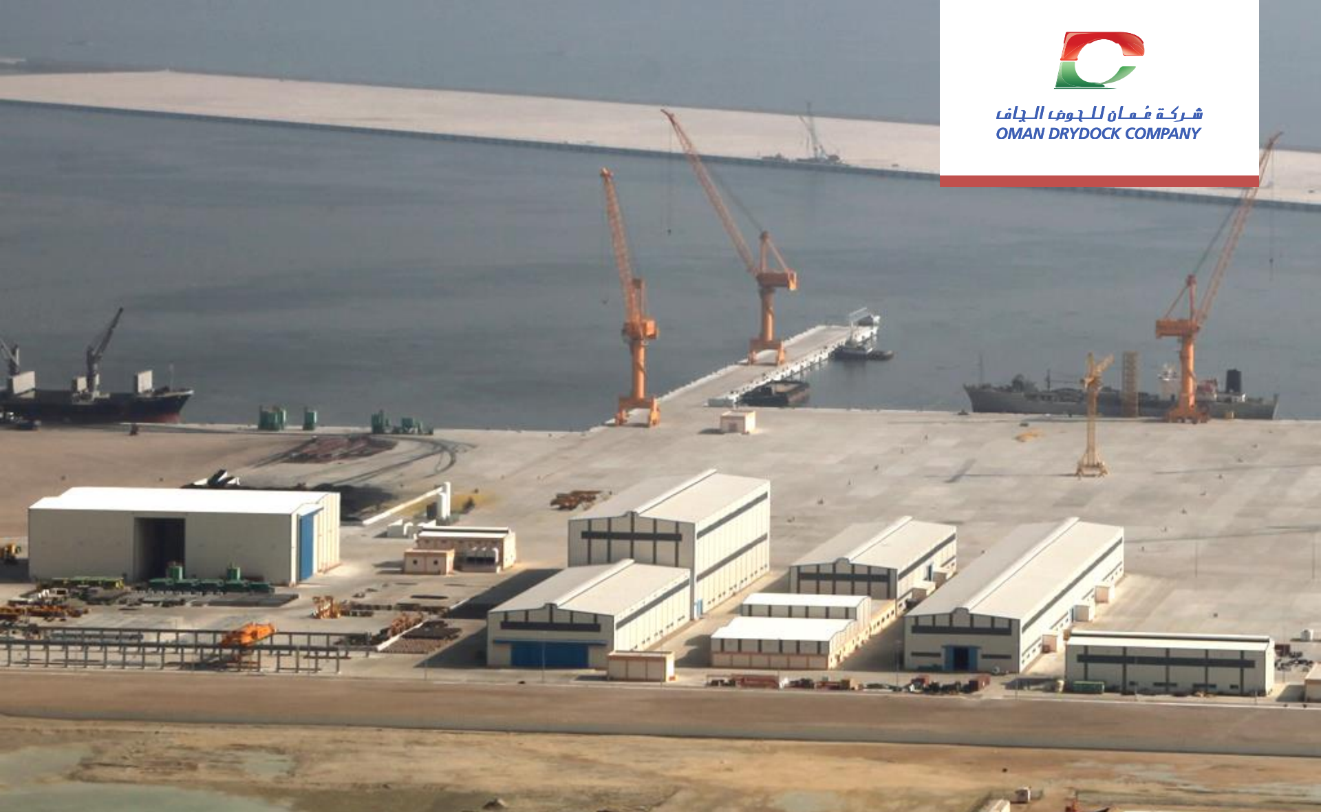
Shop Area – Back View

شركة عُمان للجوزف الجاف OMAN DRYDOCK COMPANY